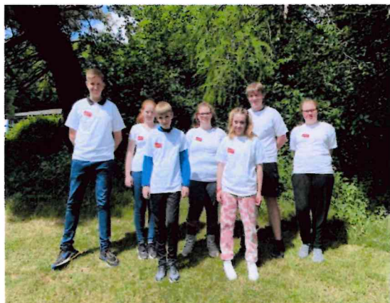
Breck Ambassadors at a training day - 2022

This year we began a small pilot of our Breck Ambassador programme in Surrey, with funding from the Police and Crime Commissioner's office. As part of this programme, we delivered our presentation to 5 Surrey police Cadet units including 33 police cadets (children aged between 13 and 17). Of this number, 7 signed up to become Breck