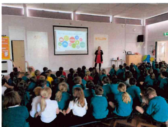
September 2021 – Cadland School.

In this period, we have delivered our lifesaving talks to children, teachers and parents at primary and secondary schools, both state and private. We have also delivered to police forces, the East Anglian Air Ambulance service, rotary and to many corporates.